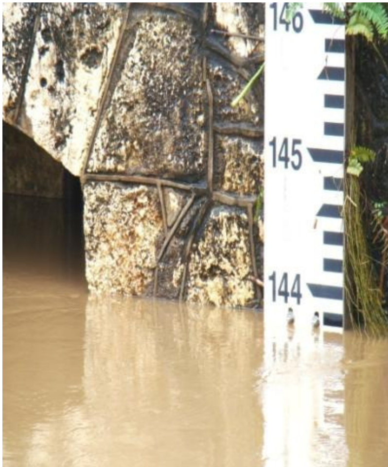
NIC Water Level Gauge