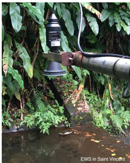
EWS in Saint Vincent

potential threats and aiding in the coordination of the national level response based on the data readings from the equipment.