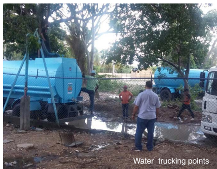
Water trucking points