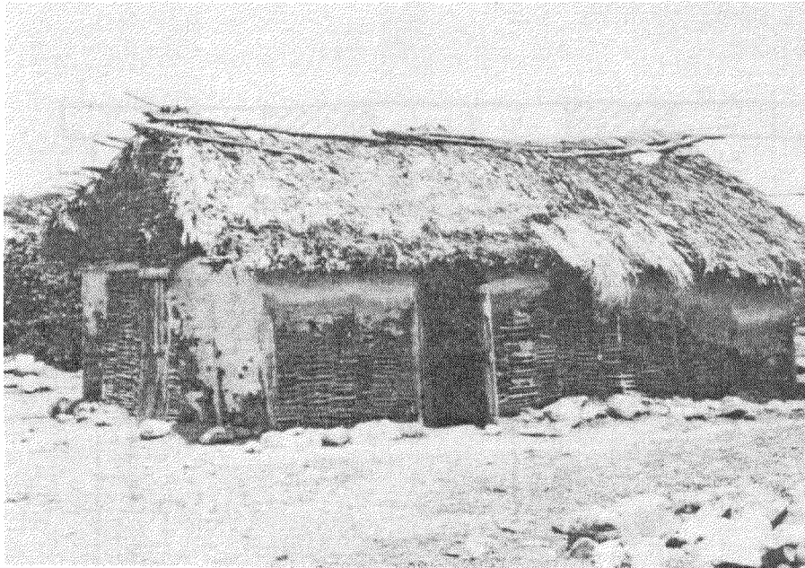
A "teja mani" dwelling, very typical in both the Dom. Rep. and Haiti. Notice how the earth has washed away from the weave.